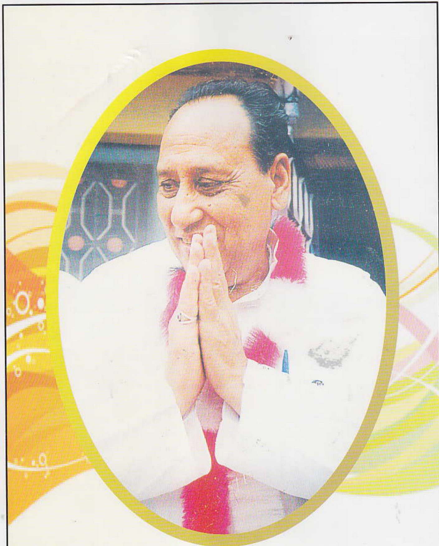
Babu Kedar Nath Singh